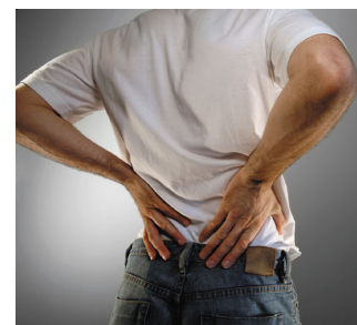
Soothe sore muscles, joints and back with Peppermint & PanAway

Peppermint and PanAway ease stressed muscles and joints. Make a custom massage oil by mixing six drops of either essential oil with one or more tablespoons of V-6 Pure Vegetable Oil Complex. Massage onto affected area. Or just apply topically and cover with a moist, hot towel. Feel the relief soak in deep.